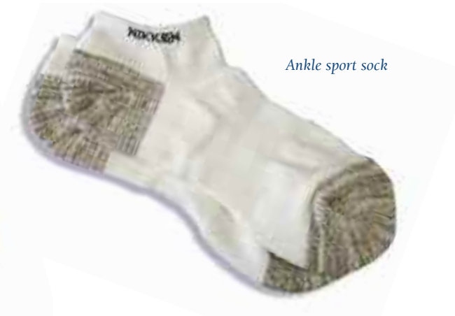
Ankle sport sock