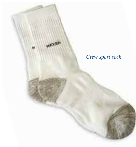
Crew sport sock